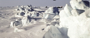
1: Polar Regions