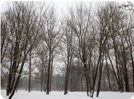
deciduous trees in winter

Trees can be deciduous or evergreen. Deciduous trees lose their leaves in autumn and have bare branches in winter. Evergreen trees shed old leaves and grow new leaves all year round, which means they keep their leaves in winter.