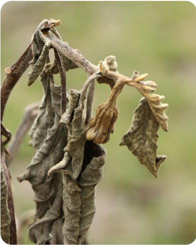
unhealthy aubergine plant