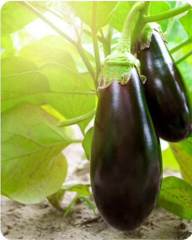
healthy aubergine plant

Plants need space to grow. If an area is overcrowded, the nutrients and water in the soil are used up. Overcrowding also blocks sunlight.