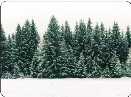
evergreen trees in winter