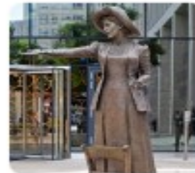
Statue of Emmeline Pankhurst

A memorial is made to remind people of a significant person or event. Memorials can include statues, monuments, plaques and stamps.