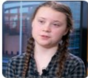
Greta Thunberg campaigns to stop climate change.