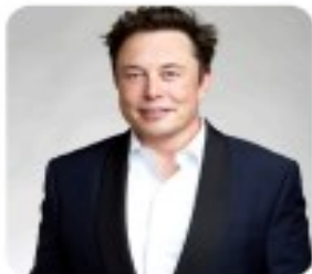
Elon Musk is trying to make a rocket to go to Mars.