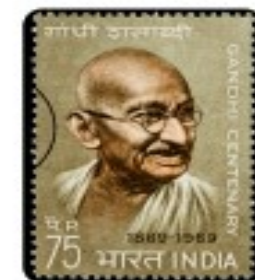
Stamp of Mahatma Gandhi