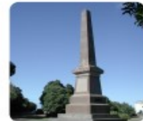
Monument to Captain James Cook