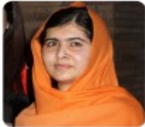
Malala Yousafzai campaigns for girls to have the right to go to school.

Significant people are still making big changes in the world today.