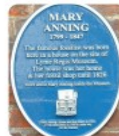
Plaque for Mary Anning